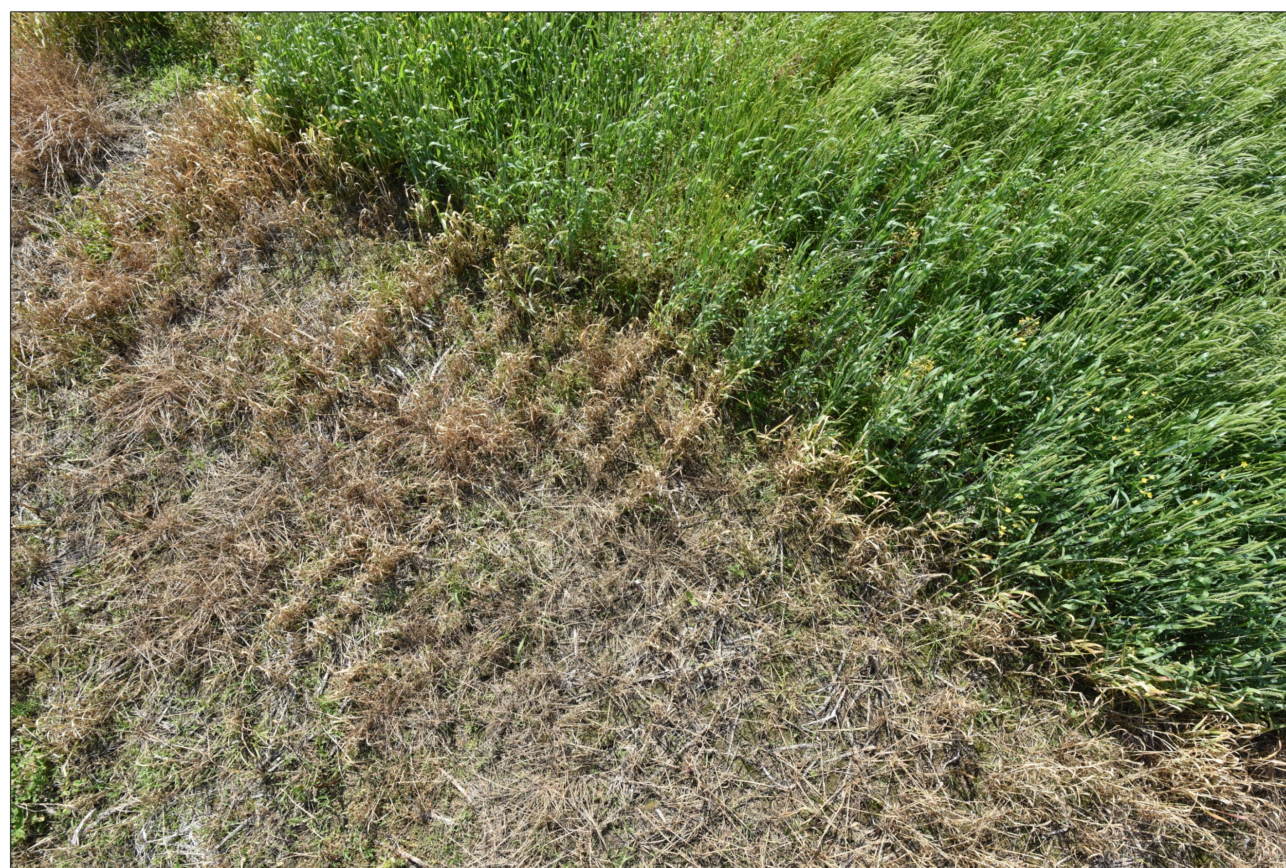
Figure 1. Brown and green canopy was determined using Canopeo software. This image was estimated to be 38.26 % green canopy.