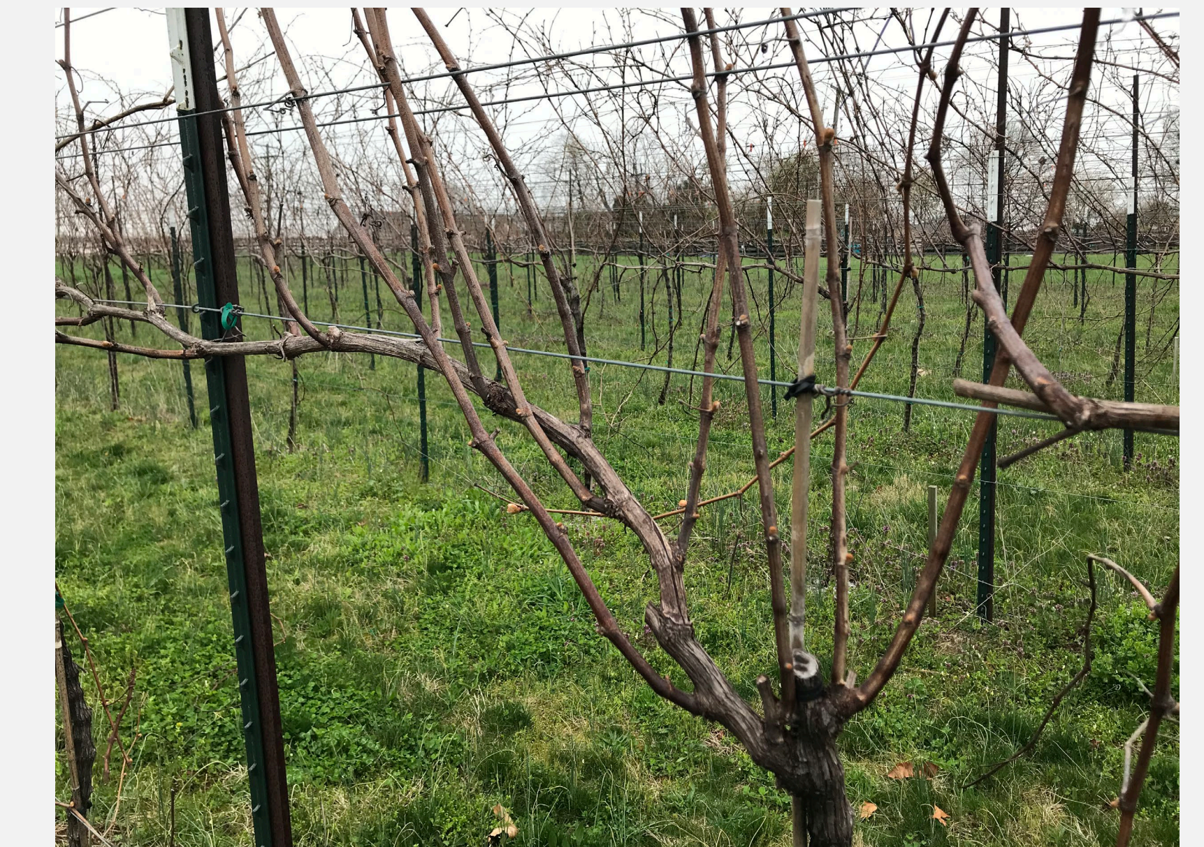
Figure 3. Treatment vine before unilateral cane pruning was applied