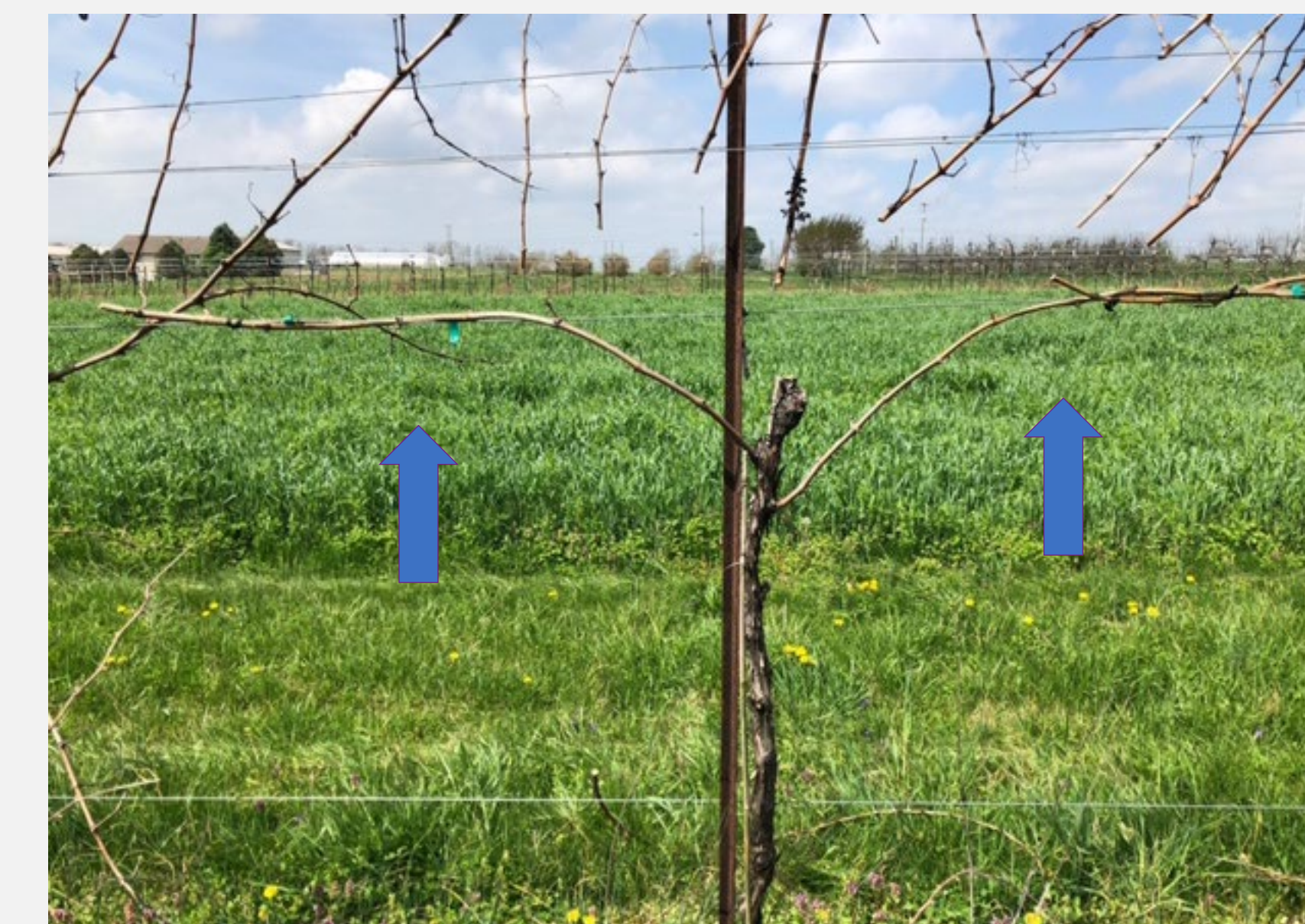
Figure 2. Cane pruned vine. Bilateral 1-yr-old fruiting canes are indicated by arrows