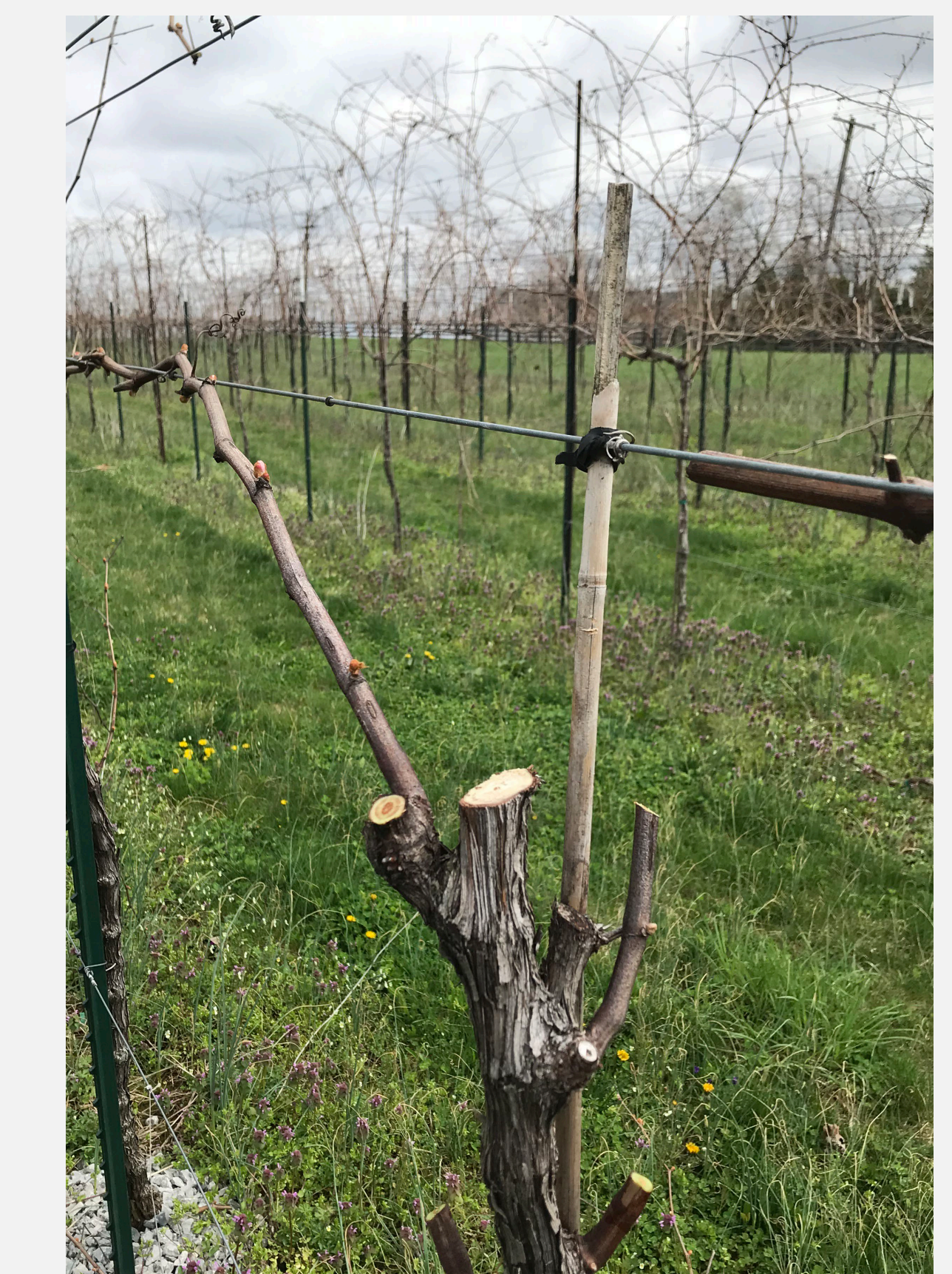
Figure 4. Treatment vine after unilateral cane pruning was applied

*Results were not statistically significant ( P > 0.05 )